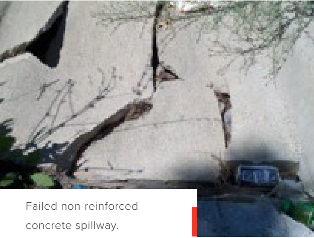
Failed non-reinforced concrete spillway.

INSTANT IMPROVEMENT IN STORMWATER FLOW AND EROSION CONTROL REALIZED.