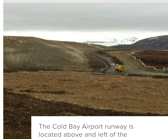
The Cold Bay Airport runway is located above and left of the SmartDitch channel. SmartDitch will carry run-off away from the runway and protect the slope from erosion.

SmartDitch is manufactured in the USA. It is a safe, economical, long-lasting, and environmentally sound irrigation channel lining solution. For more information on the SmartDitch and the MegaDitch HDPE Channel Lining Systems contact: