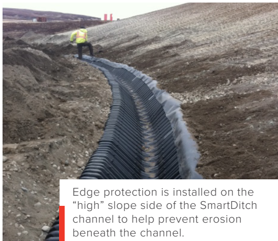
Edge protection is installed on the "high" slope side of the SmartDitch channel to help prevent erosion beneath the channel.

Project Came in 30% Below Budget, Customer Pleased With Performance. Since it typically takes 50% more rip rap to achieve the same flow and performance characteristics of SmartDitch, it was estimated that Smartditch saved the airport 30% (including cost of materials and installation), which is pretty significant savings!