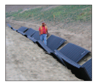
SmartDitch sections, manufactured in 8' - 10' lengths, are ready for joining in the shallow trench or above the ground and set into place.