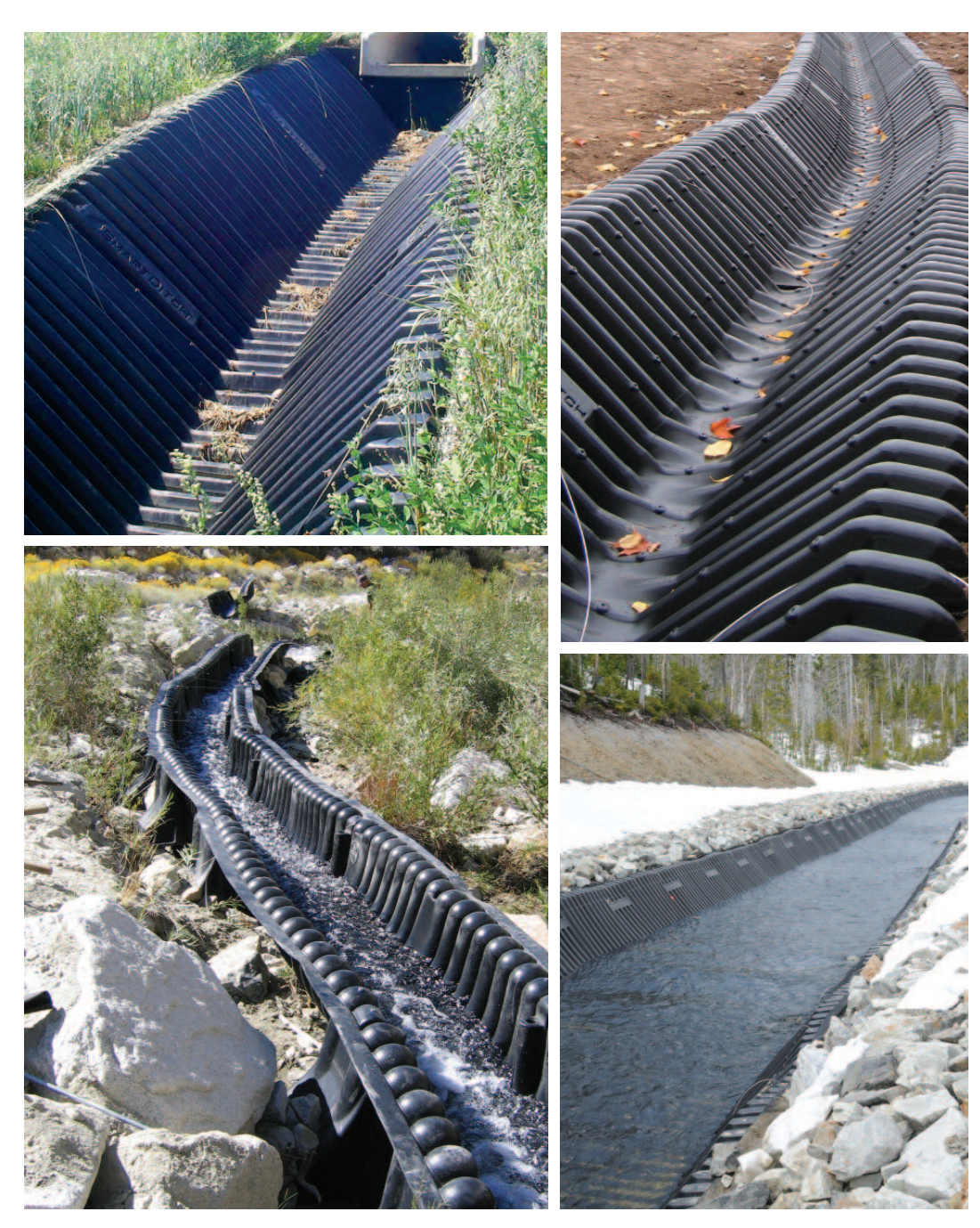
SmartDitch comes in sizes for nearly any application. Choose from 12" depth trapezoidal, 24" depth trapezoidal, 24" depth trapezoidal, 24" depth semi-circular or the expandable MegaDitch. Its ribbed design provides strength and exceptional flow control. Its flexible, yet light weight construction makes SmartDitch ideal for difficult to access, uneven terrain or steep slopes.

SmartDitch is a leak-free channel lining system engineered to control and direct the flow of water or critical fluids. Made from proven UV resistant HDPE, SmartDitch's unique corrugated design helps regulate the flow of water from flat to steep grades so that the drainage and flow patterns designed are maintained.