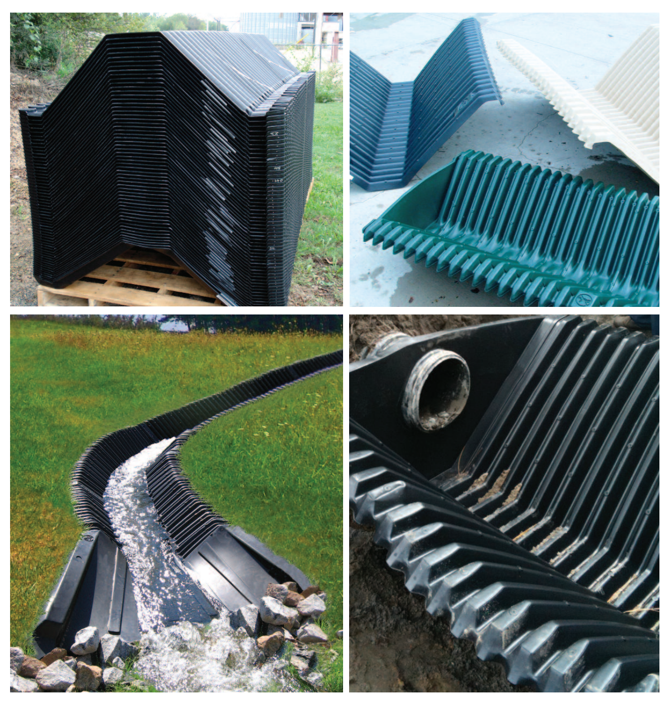
SmartDitch sections are efficiently shipped on pallets and are easy to transport. The product is available in three colors: black, green and sand. The SmartDitch system takes 'versatility' one step further with specially-engineered fittings such as multi-directional sections, gate valves, transitions, flared inlets/outlets and bulkheads (shown). All are designed to broaden the range of use and tie into existing drainage systems.

The versatility of SmartDitch makes it the best solution for many applications. The multiple sizes and fittings make designing for even the most complex situation cost effective and easy. In addition to traditional channel design, the SmartDitch system is often specified to form defined ditches to control erosion and catch loose sediment. SmartDitch is also used for both permanent and temporary applications, and in-ground, as well as above-ground, temporary flow diversions.